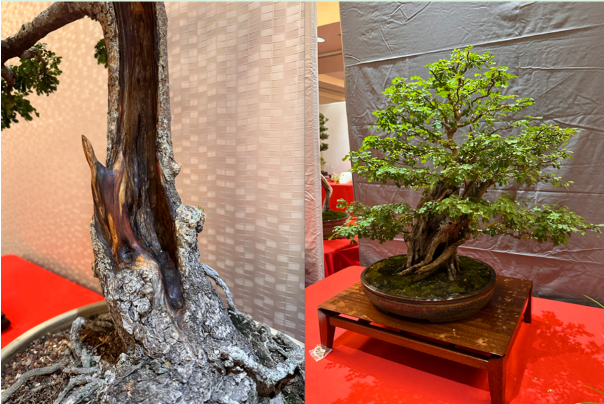
LSBF Exhibit Corpus Christi, Texas - September 2025