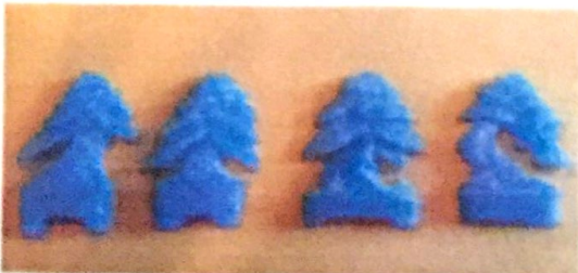
LOST WAX CARVING